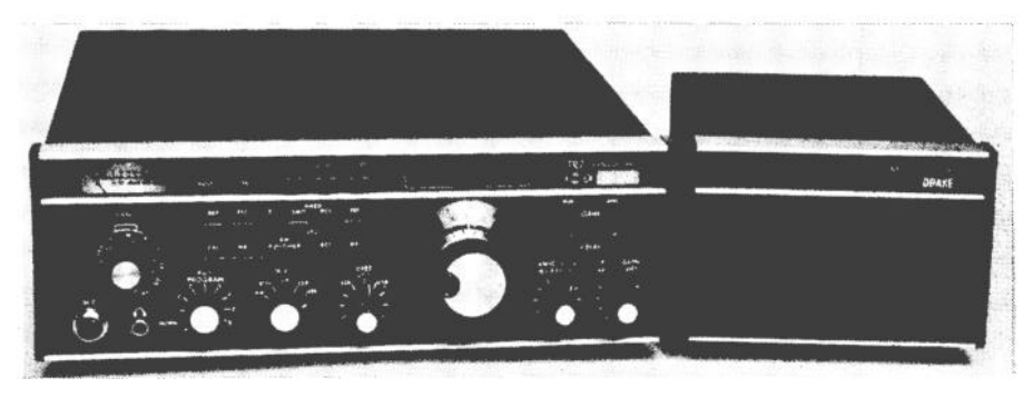
The Drake TR-7, shown here with matching MS-7 speaker.

Price: TR-7/DR-7, $1295; power supply, $195; accessory filters, $52 each. Manufacturer: R. L. Drake Co., 540 Richard St., Miamisburg, OH 45342.